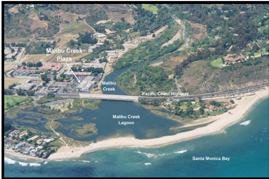
Figure 1: Site Location for Malibu Creek Plaza

The Malibu Creek Plaza is a shopping plaza consisting of both retail and commercial businesses. Some of the current occupants include: a multi-screen theater, three full serve restaurants, an ice cream parlor, a dry cleaner, a bank, a pet store which also grooms pets, and other retail businesses. It is located in an environmentally sensitive area. Malibu Lagoon is approximately 200 feet south of the site. The Pacific Ocean is approximately 1,400 feet south of the site. Both Malibu Creek and Malibu Lagoon are currently identified as impaired for both nutrients and bacteria in the States 303(d) listing. The septic tanks and leach fields for Malibu Creek Plaza are located in the Malibu Creek Hydrologic Sub-area and overlie the Malibu Valley Groundwater Basin. Figure 1 shows the location of Malibu Creek Plaza.